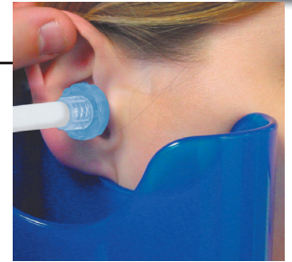
Improved patient comfort thanks to the soft "gentle touch" design