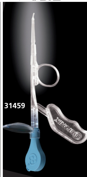
Lighted forceps for foreign body removal with LED illuminator