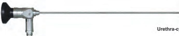
Urethra-cystoscope, arthroscope, hysteroscope, otoscope (without sheath)