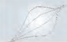
Fold Angular Basket Type Grasping Forceps