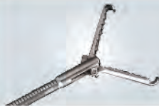
Pelican Jaws Type Grasping Forceps