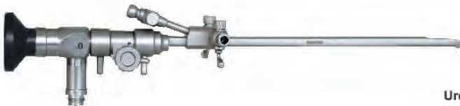
Urethra-cystoscope, arthroscope, hysteroscope, otoscope (with sheath)